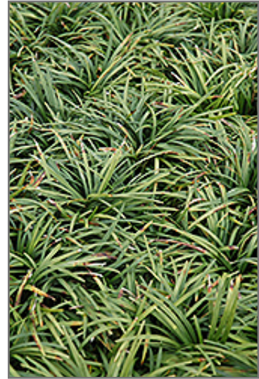
Dwarf Mondo Grass foliage