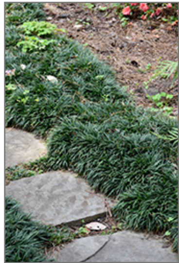
Dwarf Mondo Grass