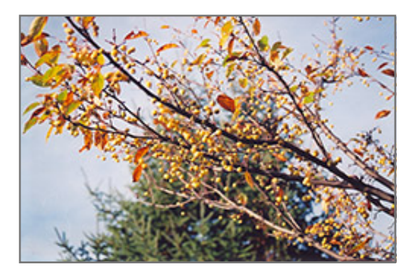
Harvest Gold Flowering Crab fruit

Bandera Location 8516 Bandera Road San Antonio, TX 78250 (210) 680-2394