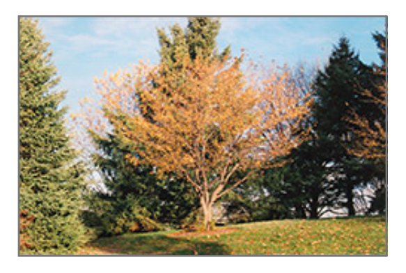
Harvest Gold Flowering Crab fruit

Thousand Oaks Location 2585 Thousand Oaks San Antonio, TX 78232 (210) 494-6131