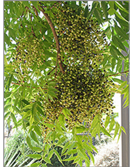
Chinese Pistache fruit

This tree should only be grown in full sunlight. It is very adaptable to both dry and moist growing conditions, but will not tolerate any standing water. It may require supplemental watering during periods of drought or extended heat. It is not particular as to soil type or pH. It is highly tolerant of urban pollution and will even thrive in inner city environments. This species is not originally from North America.