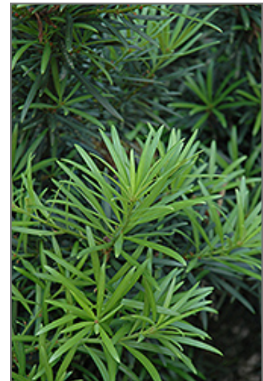
Japanese Yew foliage