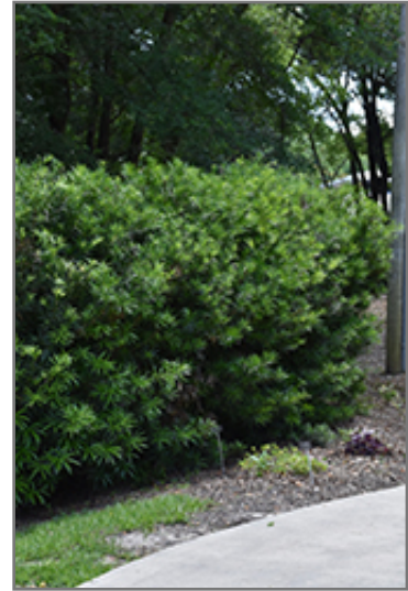
Japanese Yew

This tree does best in full sun to partial shade. It does best in average to evenly moist conditions, but will not tolerate standing water. It may require supplemental watering during periods of drought or extended heat. It is not particular as to soil type or pH. It is somewhat tolerant of urban pollution. This species is not originally from North America.