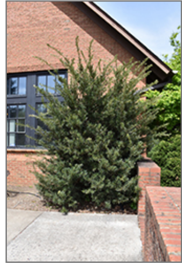
Japanese Yew

Japanese Yew will grow to be about 30 feet tall at maturity, with a spread of 15 feet. It has a low canopy with a typical clearance of 3 feet from the ground, and is suitable for planting under power lines. It grows at a slow rate, and under ideal conditions can be expected to live for 50 years or more.