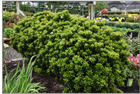
Dwarf Yeddo Hawthorn

Dwarf Yeddo Hawthorn is recommended for the following landscape applications;