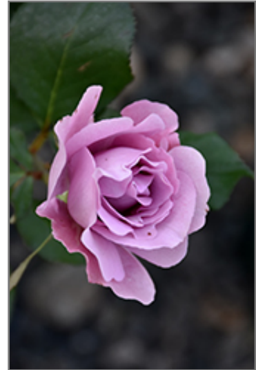
Angel Face Rose flowers