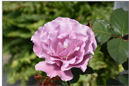
Angel Face Rose flowers