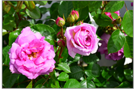
Angel Face Rose flowers

Angel Face Rose will grow to be about 3 feet tall at maturity, with a spread of 3 feet. It tends to fill out right to the ground and therefore doesn't necessarily require facer plants in front. It grows at a fast rate, and under ideal conditions can be expected to live for approximately 30 years.