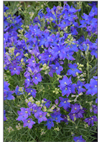
Diamonds Blue Delphinium flowers

Diamonds Blue Delphinium is recommended for the following landscape applications;