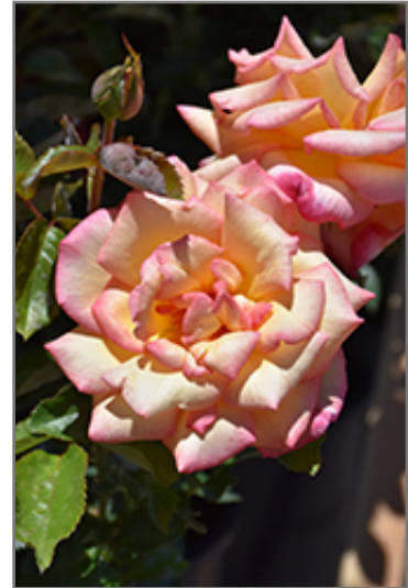
Sheila's Perfume Rose flowers

Sheila's Perfume Rose is recommended for the following landscape applications;