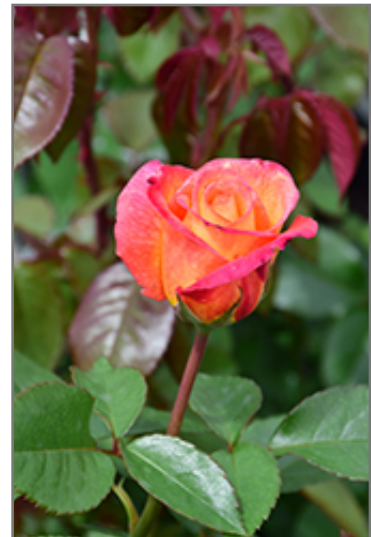
Sheila's Perfume Rose flowers