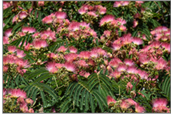
Ombrella Mimosa flowers

Ombrella Mimosa is recommended for the following landscape applications;