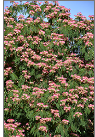
Ombrella Mimosa flowers

This tree should only be grown in full sunlight. It is very adaptable to both dry and moist growing conditions, but will not tolerate any standing water. It may require supplemental watering during periods of drought or extended heat. It is not particular as to soil type or pH, and is able to handle environmental salt. It is highly tolerant of urban pollution and will even thrive in inner city environments. This is a selected variety of a species not originally from North America.