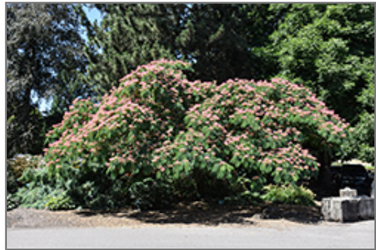
Ombrella Mimosa in bloom