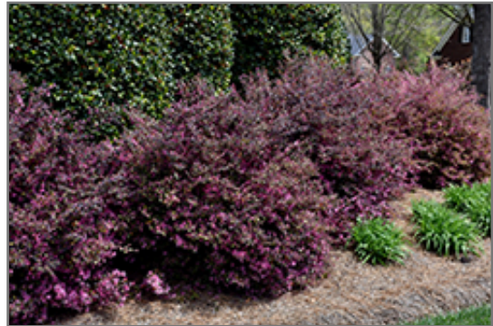
Purple Diamond Fringeflower in bloom