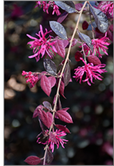
Purple Diamond Fringeflower flowers

Purple Diamond Fringeflower is recommended for the following landscape applications;