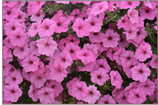
Supertunia Vista Bubblegum Petunia flowers