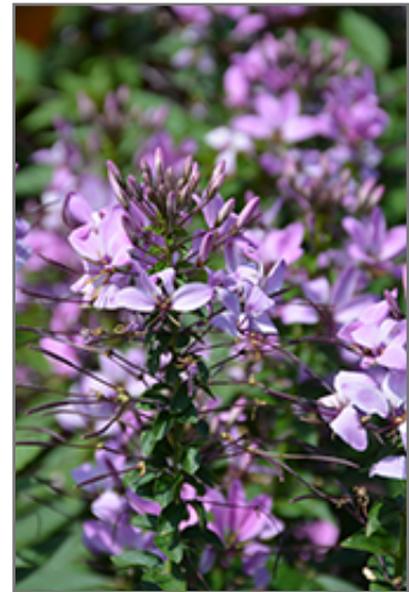
Senorita Rosalita Spiderflower flowers

This plant will require occasional maintenance and upkeep, and should be cut back in late fall in preparation for winter. It is a good choice for attracting butterflies to your yard, but is not particularly attractive to deer who tend to leave it alone in favor of tastier treats. It has no significant negative characteristics.