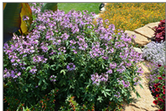
Senorita Rosalita Spiderflower in bloom