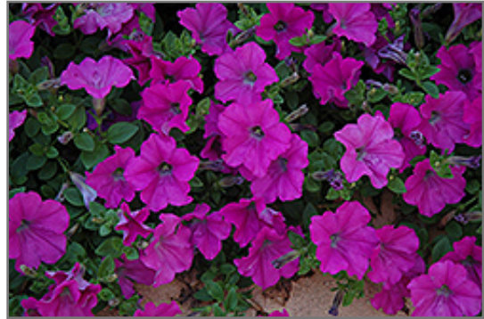
Wave Lavender Petunia flowers