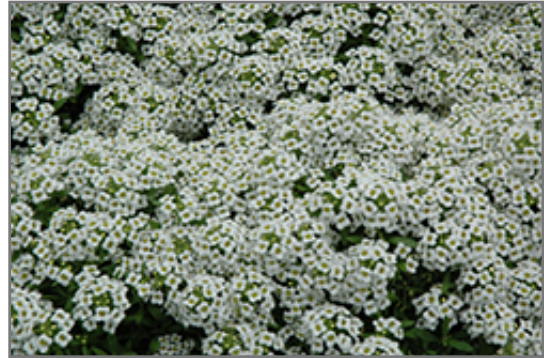
Snow Crystals Alyssum flowers

Other Names: Sweet Alyssum, Alyssum maritimum, Sweet Alison