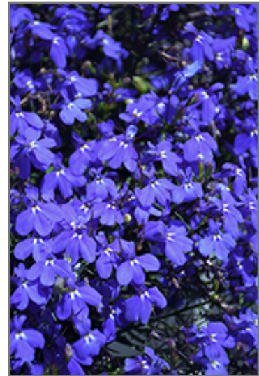
Techno Blue Lobelia flowers

Techno Blue Lobelia is recommended for the following landscape applications;