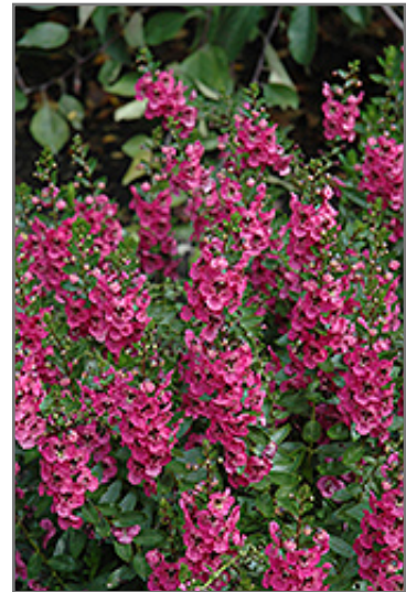
Archangel Dark Rose Angelonia flowers

Archangel Dark Rose Angelonia is an herbaceous evergreen perennial with an upright spreading habit of growth. Its relatively fine texture sets it apart from other garden plants with less refined foliage.