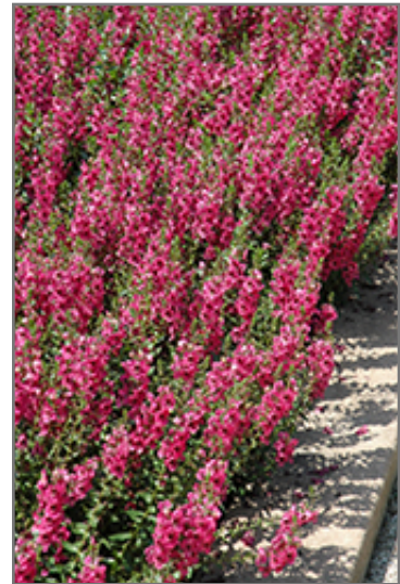
Archangel Dark Rose Angelonia flowers

Archangel Dark Rose Angelonia is a fine choice for the garden, but it is also a good selection for planting in outdoor containers and hanging baskets. It is often used as a 'filler' in the 'spiller-thriller-filler' container combination, providing a mass of flowers against which the larger thriller plants stand out. Note that when growing plants in outdoor containers and baskets, they may require more frequent waterings than they would in the yard or garden.