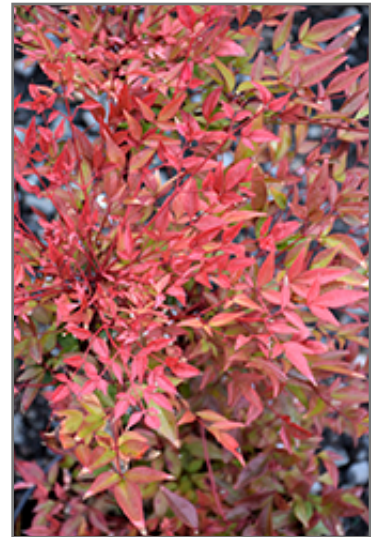
Obsession Nandina foliage