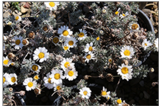
Moroccan Daisy flowers