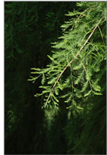
Falling Waters Baldcypress foliage