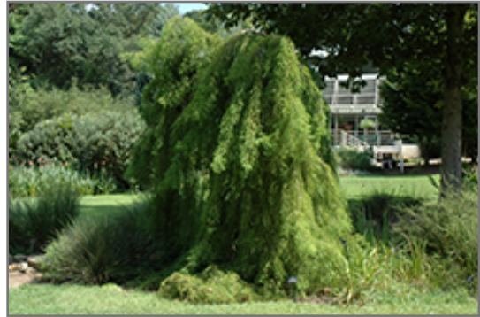
Falling Waters Baldcypress

This tree should only be grown in full sunlight. It is an amazingly adaptable plant, tolerating both dry conditions and even some standing water. It may require supplemental watering during periods of drought or extended heat. It is not particular as to soil type, but has a definite preference for acidic soils, and is subject to chlorosis (yellowing) of the foliage in alkaline soils. It is somewhat tolerant of urban pollution. Consider applying a thick mulch around the root zone in winter to protect it in exposed locations or colder microclimates. This is a selection of a native North American species.