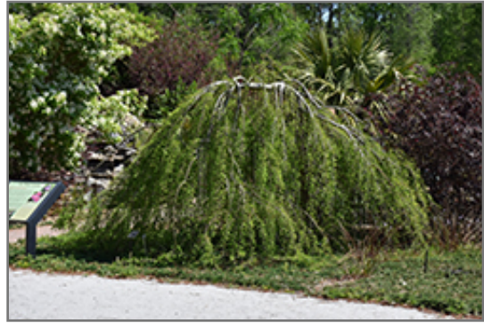
Falling Waters Baldcypress