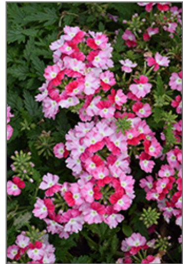
Lanai Twister Red Verbena flowers

Lanai Twister Red Verbena is recommended for the following landscape applications;