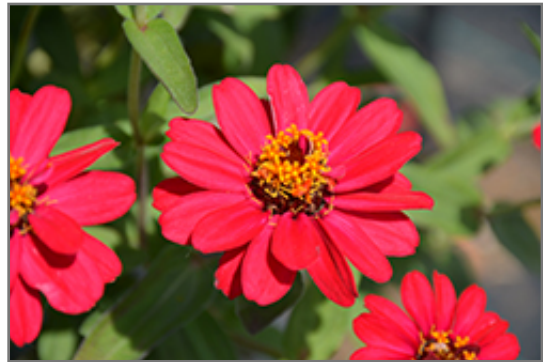
Profusion Double Hot Cherry Zinnia flowers