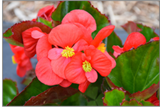
Big Red Green Leaf Begonia flowers