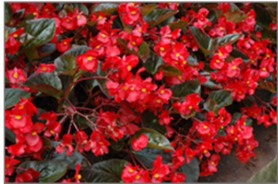
Whopper Red Bronze Leaf Begonia flowers

Whopper Red Bronze Leaf Begonia is an herbaceous evergreen perennial with a mounded form. Its medium texture blends into the garden, but can always be balanced by a couple of finer or coarser plants for an effective composition.