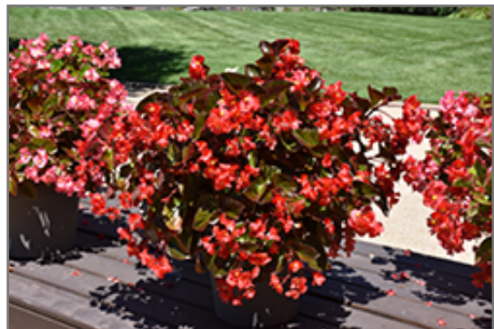
Whopper Red Bronze Leaf Begonia flowers