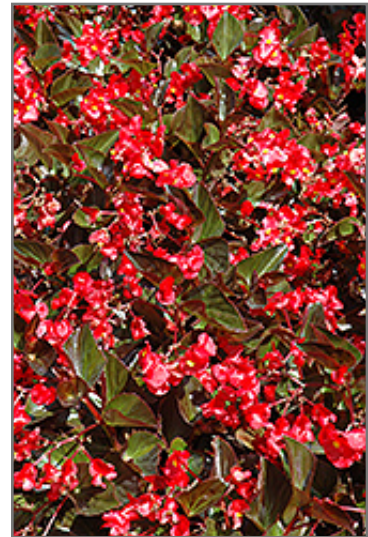
Whopper Red Bronze Leaf Begonia flowers

Whopper Red Bronze Leaf Begonia is a fine choice for the garden, but it is also a good selection for planting in outdoor containers and hanging baskets. It can be used either as 'filler' or as a 'thriller' in the 'spiller-thriller-filler' container combination, depending on the height and form of the other plants used in the container planting. It is even sizeable enough that it can be grown alone in a suitable container. Note that when growing plants in outdoor containers and baskets, they may require more frequent waterings than they would in the yard or garden.