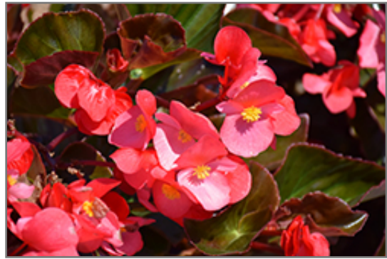
Whopper Rose Bronze Leaf Begonia flowers