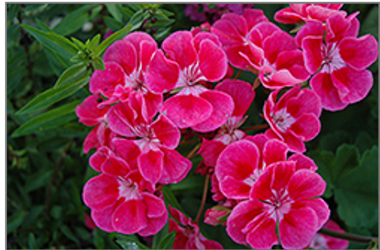
Fantasia Strawberry Sizzle Geranium flowers