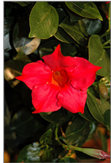
Rio Hot Pink Mandevilla flowers

A wonderful heat and drought tolerant selection boasting a mounded, compact habit, perfect for patio containers or hanging baskets; large, hot pink flowers over glossy green foliage; deadhead to encourage new blooms