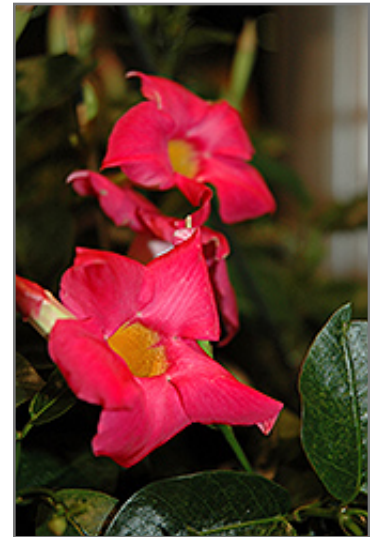
Rio Pink Mandevilla flowers

A wonderful heat and drought tolerant selection boasting a mounded, compact habit, perfect for patio containers or hanging baskets; large, bubblegum pink flowers over glossy green foliage; deadhead to encourage new blooms