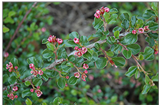
Tom Thumb Cotoneaster flowers