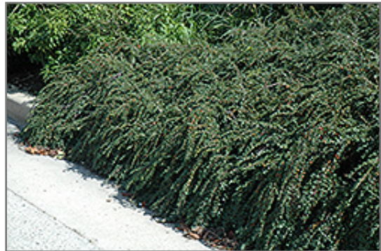
Tom Thumb Cotoneaster