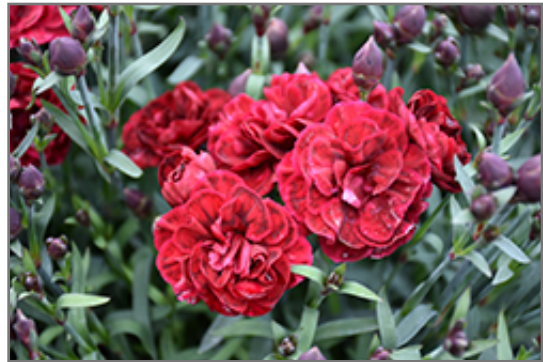
SuperTrouper Butterfly Dark Red Carnation flowers