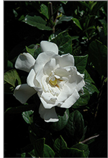
Whispering Pines Gardenia flowers

Whispering Pines Gardenia will grow to be about 5 feet tall at maturity, with a spread of 3 feet. It has a low canopy, and is suitable for planting under power lines. It grows at a slow rate, and under ideal conditions can be expected to live for approximately 30 years.