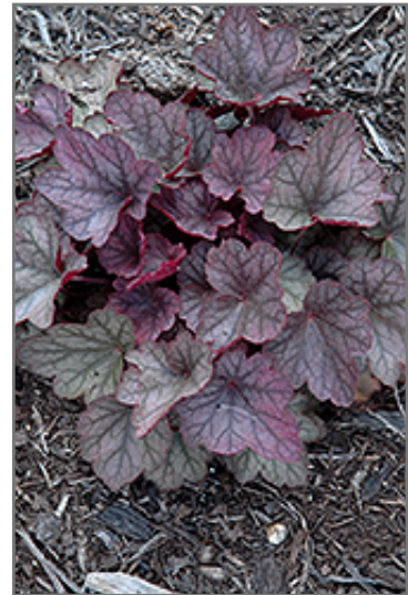
Carnival Rose Granita Coral Bells foliage

Carnival Rose Granita Coral Bells is recommended for the following landscape applications;