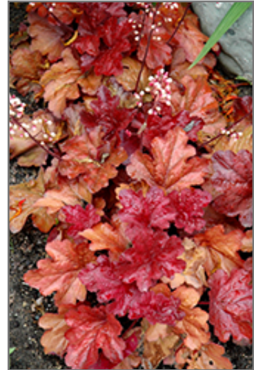
Fire Alarm Coral Bells

Fire Alarm Coral Bells is recommended for the following landscape applications;