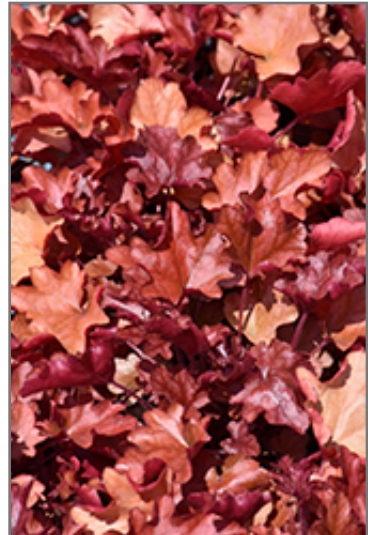
Fire Alarm Coral Bells foliage