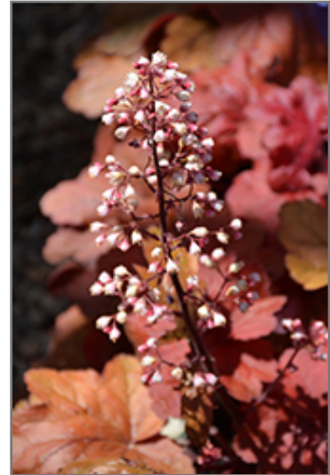
Fire Alarm Coral Bells flowers

Fire Alarm Coral Bells is a fine choice for the garden, but it is also a good selection for planting in outdoor pots and containers. It is often used as a 'filler' in the 'spiller-thriller-filler' container combination, providing a mass of flowers and foliage against which the larger thriller plants stand out. Note that when growing plants in outdoor containers and baskets, they may require more frequent waterings than they would in the yard or garden.