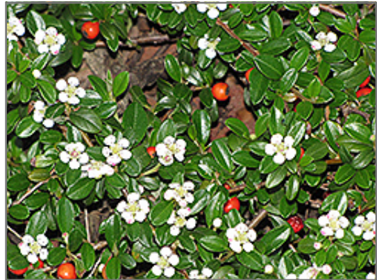
Coral Beauty Cotoneaster fruit

Coral Beauty Cotoneaster will grow to be about 12 inches tall at maturity, with a spread of 5 feet. It tends to fill out right to the ground and therefore doesn't necessarily require facer plants in front. It grows at a fast rate, and under ideal conditions can be expected to live for approximately 30 years.