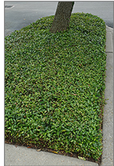
Asian Jasmine