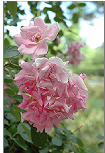
Climbing Pinkie Rose flowers

Climbing Pinkie Rose is recommended for the following landscape applications;