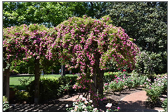
Climbing Pinkie Rose flowers