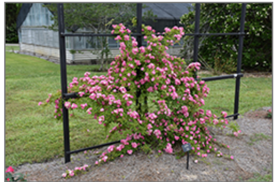
Peggy Martin Rose in bloom