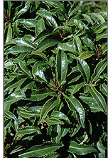
Japanese Holly foliage

Japanese Holly will grow to be about 4 feet tall at maturity, with a spread of 6 feet. It has a low canopy. It grows at a medium rate, and under ideal conditions can be expected to live for 40 years or more.