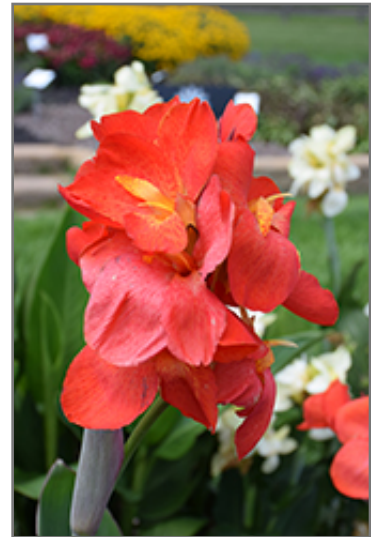
South Pacific Scarlet Canna flowers

This plant should only be grown in full sunlight. It requires an evenly moist well-drained soil for optimal growth, but will die in standing water. It may require supplemental watering during periods of drought or extended heat. It is not particular as to soil pH, but grows best in rich soils. It is highly tolerant of urban pollution and will even thrive in inner city environments, and will benefit from being planted in a relatively sheltered location. Consider applying a thick mulch around the root zone in winter to protect it in exposed locations or colder microclimates. This particular variety is an interspecific hybrid. It can be propagated by division; however, as a cultivated variety, be aware that it may be subject to certain restrictions or prohibitions on propagation.