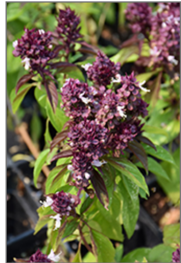
Siam Queen Basil flowers

Siam Queen Basil will grow to be about 16 inches tall at maturity, with a spread of 12 inches. When grown in masses or used as a bedding plant, individual plants should be spaced approximately 10 inches apart. This fast-growing annual will normally live for one full growing season, needing replacement the following year.