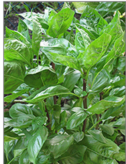
Siam Queen Basil foliage