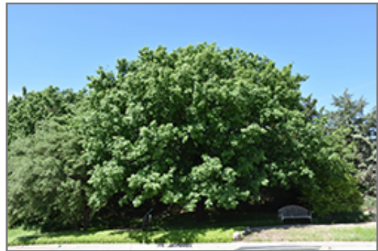
Monterrey Oak