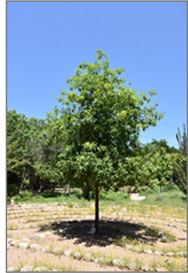
Monterrey Oak

Monterrey Oak is recommended for the following landscape applications;