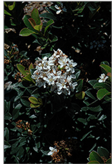
Snow White Indian Hawthorn flowers