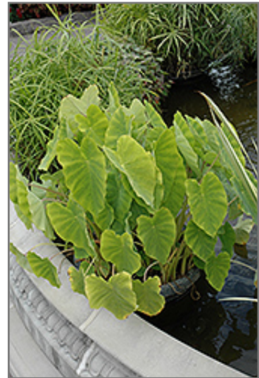
Elephant Ear

This plant does best in full sun to partial shade. It is quite adaptable, preferring to grow in average to wet conditions, and will even tolerate some standing water. It may require supplemental watering during periods of drought or extended heat. It is not particular as to soil pH, but grows best in rich soils. It is somewhat tolerant of urban pollution. This species is not originally from North America. It can be propagated by division.