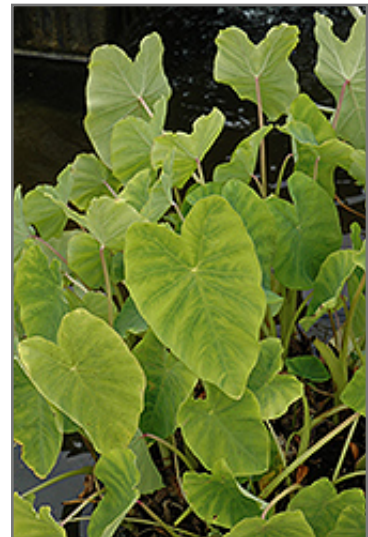
Elephant Ear foliage