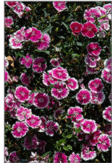
Telstar Purple Picotee Pinks flowers

Telstar Purple Picotee Pinks is recommended for the following landscape applications;