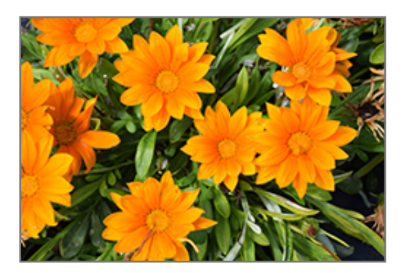
New Day Clear Orange Gazania flowers

Bandera Location 8516 Bandera Road San Antonio, TX 78250 (210) 680-2394