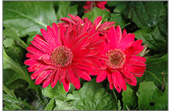
Royal Deep Rose Gerbera Daisy flowers