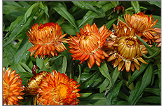
Helica Orange Strawflower flowers

Compact mounded plants produce brightly colored paper-like flowers from late spring through the summer; a wonderful addition to containers, hanging baskets, borders and beds; low maintenance- no deadheading needed