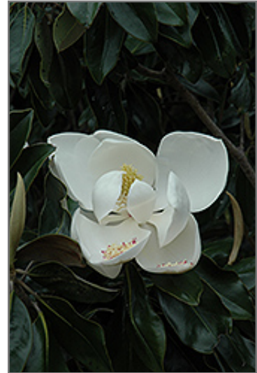
D.D. Blanchard Magnolia flowers