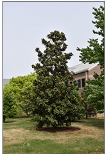
D.D. Blanchard Magnolia