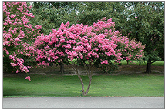
Crapemyrtle in bloom