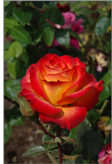
Perfect Moment Rose flowers