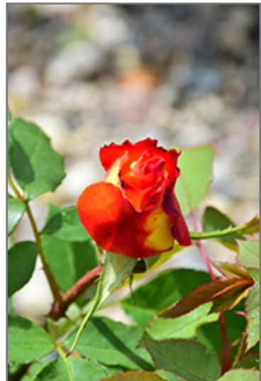
Perfect Moment Rose flower buds