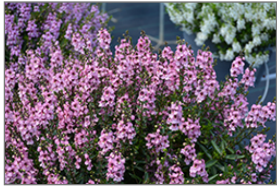
Serenita Pink Angelonia in bloom