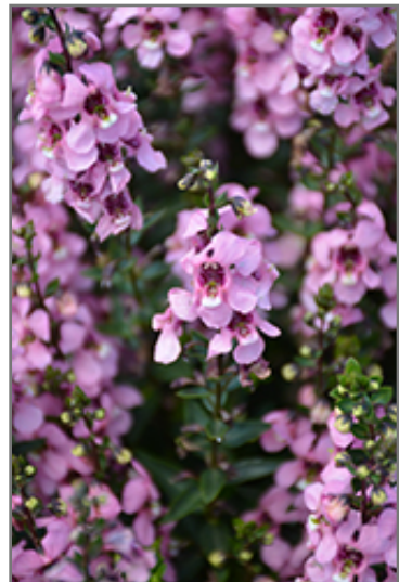
Serenita Pink Angelonia flowers